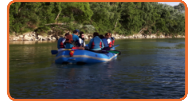
Interpretative Ebro river descent (Spain)