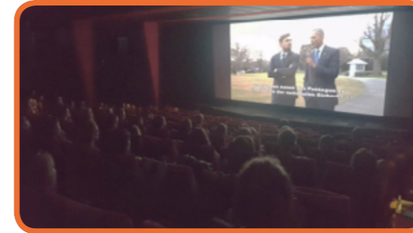
“Before the flood” Film screening (Germany)

The linked document and the whole methodology should be enriched by future experiences: Please contact the CAPFLO coordinator to share the results and learnings from your community’s participatory FRM SC building process (and/or to obtain technical support to help you develop it).