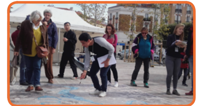
Public event on floodable areas (France)