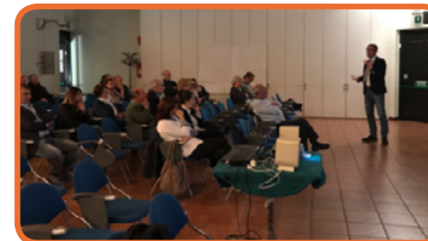
Public meeting at Rottofreno (Italy)