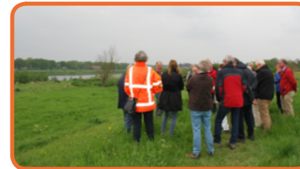
Fieldtrip to flood plain (The Netherlands)